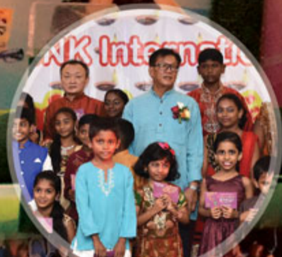
Deepavali Open House