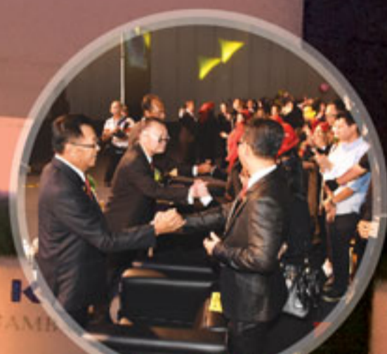
Crown Nite 2015