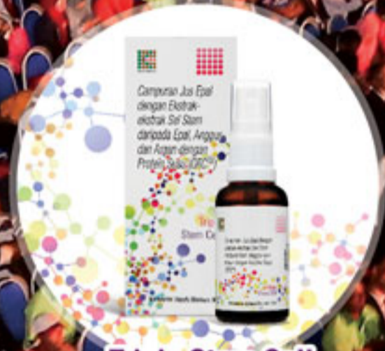
Triple Stem Cell